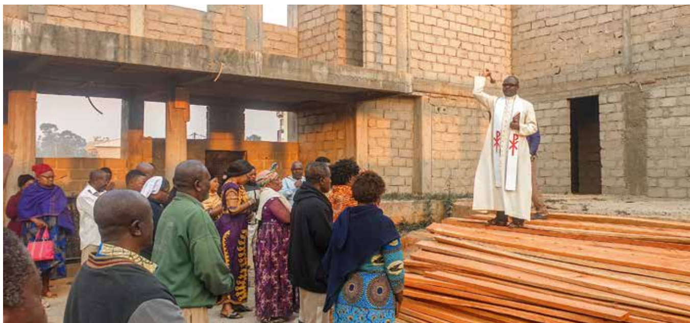
Blessing to mark the beginning of the roofing of the multi-purpose hall of St John the Baptist in Nkwen, Bamenda.