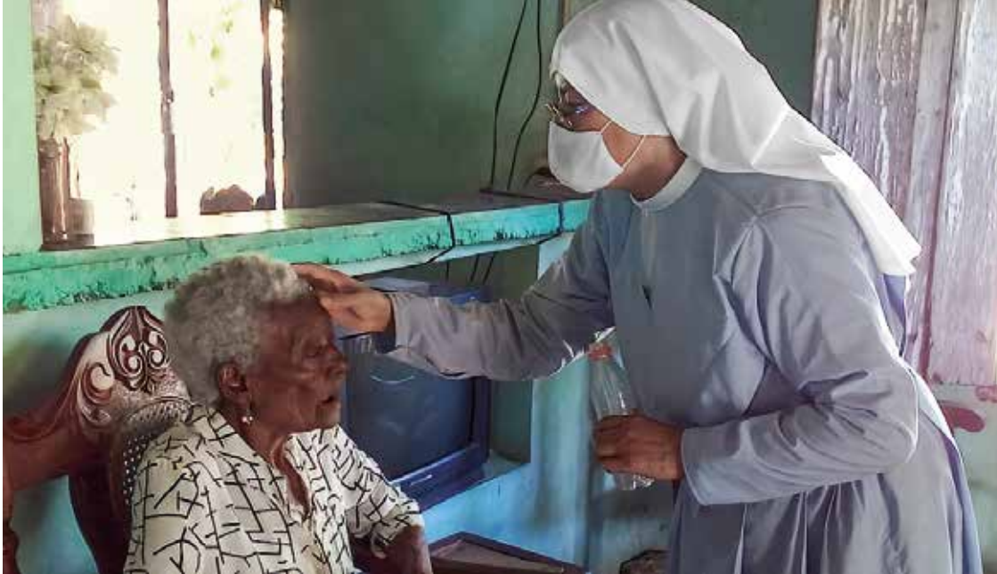
A sister from Corralillo cares for a sick person.

that the faithful feel supported and are able to draw new courage. However, the Church faces great problems in fulfilling its apostolate, as well as in pastoral care. Although about 70% of the inhabitants are baptised, only very few actively participate in Church life. The Archbishop of Santiago estimates that only about 1% of those baptised attend Holy Mass. ACN is supporting the Church in Cuba so that it can fulfil its mission under these difficult conditions. In the year under review, it supported the training of priests, for example, as well as the renovation of churches and the repair of vehicles. In addition, numerous sisters regularly receive material support.