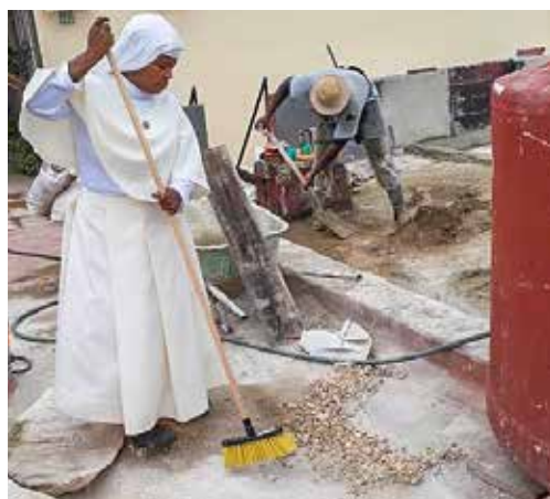
Sisters from the “Siervas de María” Convent renovating the roof.

However, most Cubans have long since given up faith in their life improving. The pandemic has further aggravated the situation. Many lack the most basic necessities. This makes it all the more important for the Church to proclaim the faith and work for those in need, so