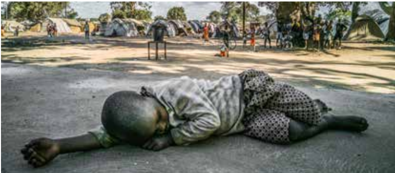
Sleeping child in the camp for internally displaced persons in Cabo Delgado Province.