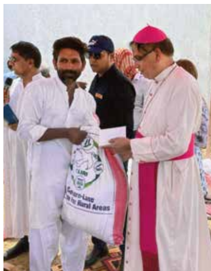
Archbishop Joseph Arshad of Islamabad-Rawalpindi distributing food to the needy in Chakwal.

Particularly worrying is the rise in cases of abduction, forced marriage and forced conversion of Christian and Hindu girls. In addition to classic aid projects, ACN therefore especially supports measures of the local Church that protect girls at risk.