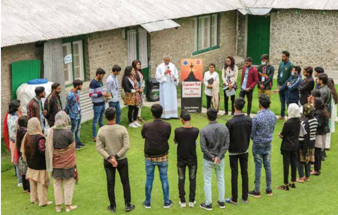
A faith capacity building seminar for Catholic students.

» Where the state fails, the Church becomes an advocate for religious minorities to protect them from discrimination and violence. «