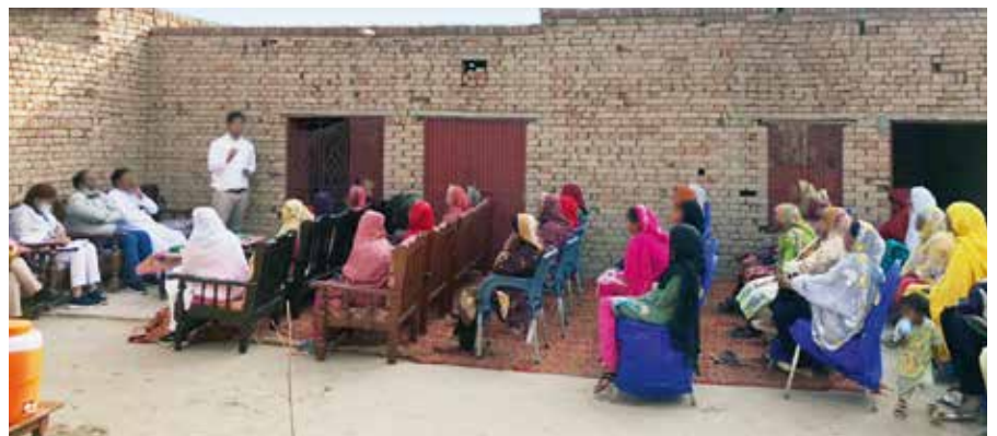
Christian girls from rural areas at a Bible study class in Faisalabad Diocese.

ACN is sponsoring a programme to support young Christian women living in extremely difficult circumstances. We were able to provide further funds to the Pakistani Catholic Church in the year under review for COVID emergency aid, training aid for candidates for the priesthood, religious and lay people, as well as for building projects and the procurement of vehicles.